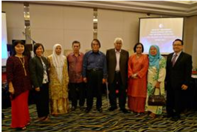
Pioneer social workers, past presidents and current members of the Executive Committee posing for a commemorative photograph

We have solicited the support from a number of renowned local and overseas scholars from universities and training institutes as our advisors for the accreditation of the courses. Meanwhile, our Association has submitted proposals to the Social