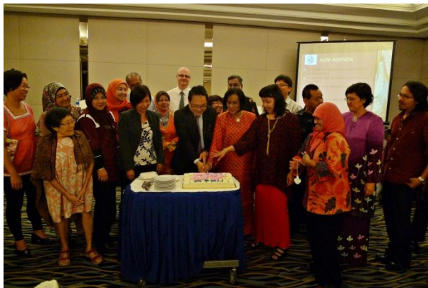
Cutting of MASW's 40th Anniversary cake

Four pioneer social workers, two of them past presidents of MASW and members were invited to cut the anniversary cake and proceeded to enjoy a buffet lunch.