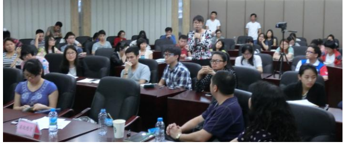
Shenzhen: 100 social work supervisors @ the lecture

Parallel to recent rapid social and economic development, social problems have been increasingly manifesting themselves. To decrease state intervention and to promote the activation of private forces as a government plan, a general action plan regarding personnel training, education, and qualifying examination is being carried out on a national level for the establishment of a system of coordination between activities by local volunteers utilizing local organizations and by professional social work specialists.