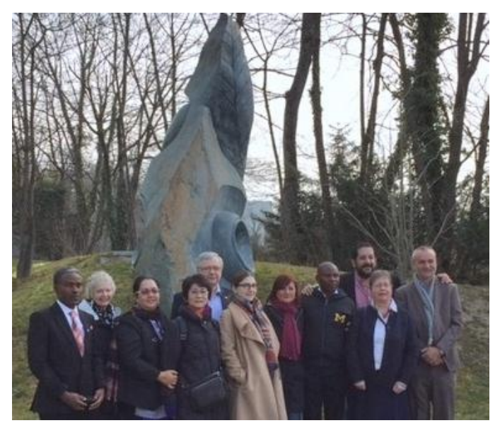
IFSW Executive Committee

Following on from the Executive Committee meeting, we were very privileged to be able to join the International Social Workers Day event hosted by UN AIDS in Geneva on the 17<sup>th</sup> March 2015. The theme was "Ending AIDS, Promoting Dignity and Respect for All". It brought together a range of speakers and experts for an informative and inspirational programme and, in raising the awareness within UNAIDS of the important role social workers can play in assisting with, not only the eradication of AIDS but also of working within the communities affected by AIDS.