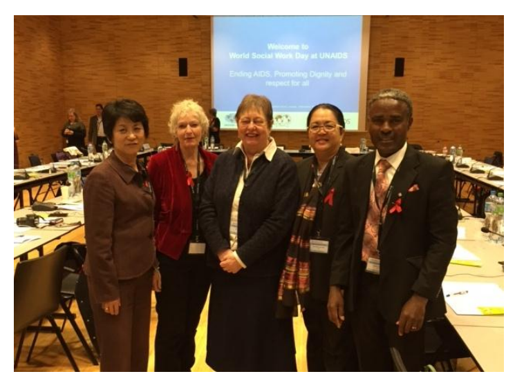
With UN AIDS Committee Members in Geneva