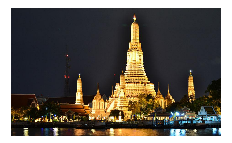
Dates: October 21- 24, 2015 (with Pre/Post Conference Workshops) Venue: Dusit Thani, Bangkok, Thailand

APASWE-IFSWAP Joint Regional Social Work Conference 2015 – Thailand