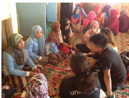
Dialog with survivors in temporary shelter in Bogor

3. Skills building sessions: Workshop sessions in the afternoon to enhance skills on psychosocial capacities. Participants were divided into two groups and visited two locations that have implemented psychosocial support program; temporary housing for survivors in area of landslides in Bogor, West Java and residential building apartment for survivors for eviction in Kampung Pulo, Jakarta.