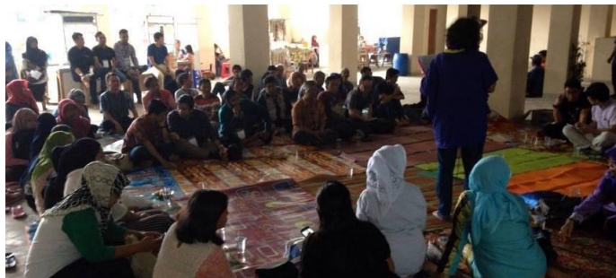
Dialog with survivors in Rusunawa Jakarta

i) Understanding psychosocial needs of disaster's survivors & Implementation of rights based approach and principles in psychosocial support; ii) Knowledge of therapies used in disaster situation & Stress management for social workers in providing psychosocial support in disaster situation; and iii) Developing psychosocial support models for: children, woman and other vulnerable groups in disaster situation & Community based psychosocial support in disaster situation.