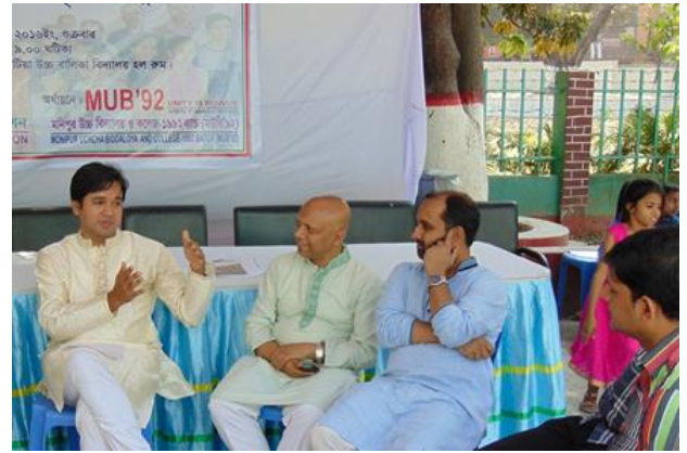
Community meeting on child Issues of the slums

Shahjalal University of Science and Technology started B of Social Sciences (Hons) in social work in the session of 1993-94. Currently this University is providing Honors, Masters and PhD degree. In addition, Jagannath University also started offering Honors and Masters along with M. Philosophy and PhD Degree. Pabna University of Science and Technology has also started Honors and Masters in social work.