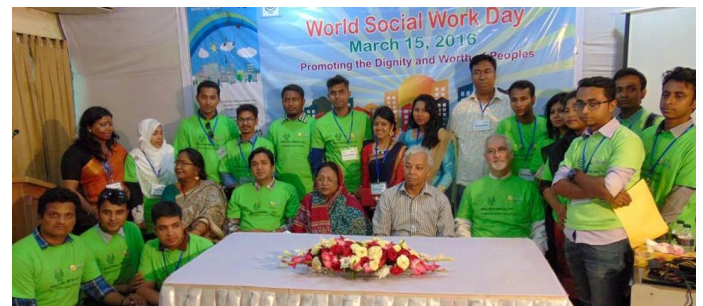
Faculty staff with students and delegates at WSWD 2016

The news of the events has been widely covered in both electronic and print media. A few other universities also observed the day accordingly. So many activities have recently been performed keeping focus on social work professional expansion towards serving humanity.