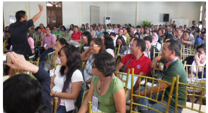
Participants enjoying a lively session

Amidst the continuing threat of disasters and the foreseeable havoc it can bring to many families and communities, the seminar workshop was deemed timely and relevant to the call of the times. The Philippines experiences major human-made and naturally-caused disasters every year, the strongest of which so far was Typhoon Yolanda (Haiyan) in 2013. Family survivors are still reeling from its traumatic effects as it taught them important lessons in life.