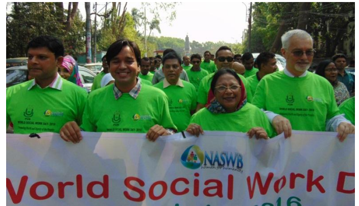
Delegates from various NGOs at the rally for WSWD 2016

Workers, Bangladesh (NASW, B) has performed a very significant role to celebrate the day so remarkably.