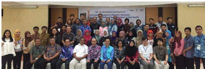
The group of speakers & participants in Indonesia 2016

Japanese Centre of Social Welfare Promotion and National Examination in February 2015. We managed to receive grants to engage in these projects for at least three years. The first workshop to train disaster relief personnel took place in Jakarta, Indonesia between 5th and 7th January 2016 and in Palawan, the Philippines from February 29th to March 3rd, 2016. Both national associations of social workers in the two countries helped extensively to organise these events. We had 50 participants in Indonesia and 160 in the Philippines, including professionals from neighbouring countries. Hence, we could contribute to development of disaster support networks and the enhancement of disaster assistance skills in these two countries, even extending to professional networks in surrounding ones.