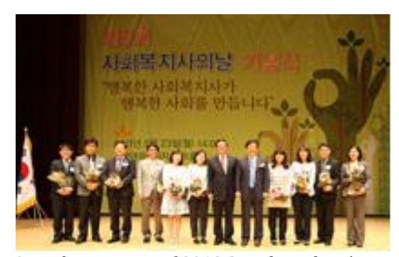
Award Recipients of 2012 Social Workers' Day

Furthermore, it held a workshop as a special program of this year, with the theme: "2012 Current Issues and Challenges of International Social Work" which was attended by social workers working in the field of international cooperation and people who are interested in international social work. The workshop was designed to introduce the "Global Agenda on Social Work and Social Development" which has been promoted since 2010, and to encourage Korean social workers to participate in it. The workshop, held on March 20, on "World Social Work" was a good opportunity to report to social workers in Korea the progress on the promotion of the "Global Agenda on Social Work and Social Development", and the trends and activities of international social work.