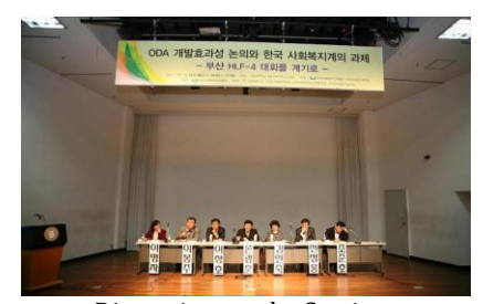
Discussions at the Seminar

The seminar served as a starting point for social workers in Korea to take an active part in the field of international development cooperation and actively cope with a number of challenges facing international societies. The KASW, with a continuous interest in development cooperation, intends to make an effort to draw social workers' attention to it and encourage them to be involved in it. In November 2012, under the support of the Korea International Cooperation Agency (KOICA) and the Korea Association of International Development and Cooperation (KAIDEC), the KASW will hold a forum titled '2012 Social Work and Social Development: the Role of Social Workers and the Challenges Faced'. Its purpose is to search for social workers' roles and future directions responding to the challenges faced in the field of international development cooperation.